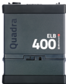
ELB 400 with battery — 424 Ws — N° 10279.1