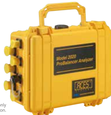
Peli™ Case shown. This picture only serves to illustrate the application.

Peli™ Storm Case allows customisation for electronics. The copolymer material can be machined, drilled and sanded smooth. This makes the Peli™ Storm Case suitable for use with bulkhead connectors.