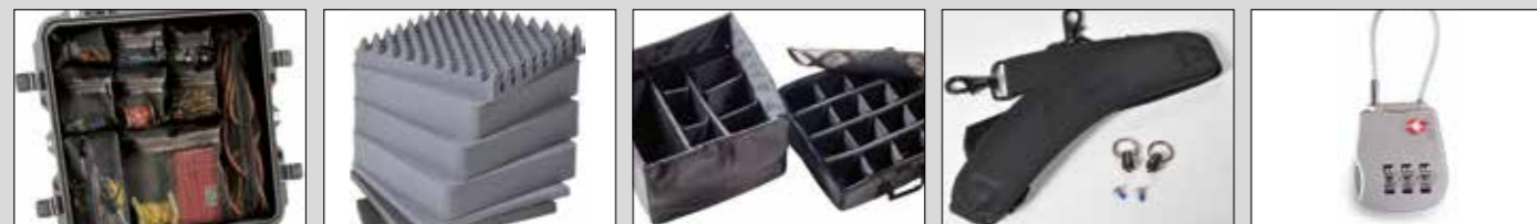
Lid Organisers Replacement Foam Padded Dividers Shoulder Straps TSA Lock

Refer to www.peli.com for specific accessories available for each case model