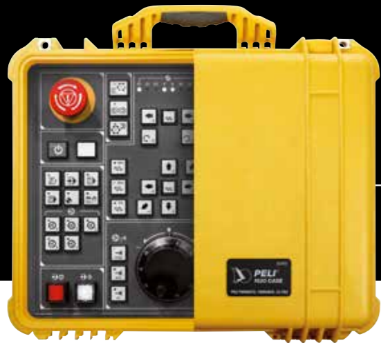
Peli™ Case shown