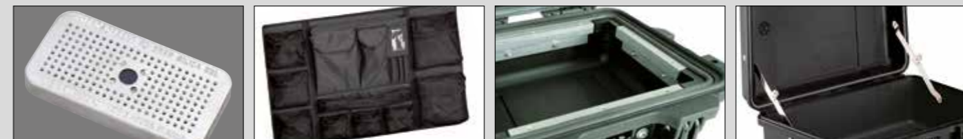
Peli Desiccant (Silica Gel) Utility Organiser Bezel Kit Lid Stays