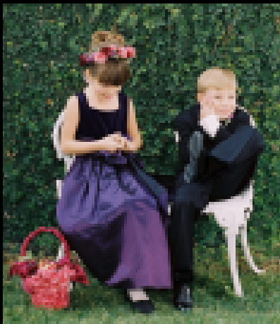
PORTRA 400NC Film