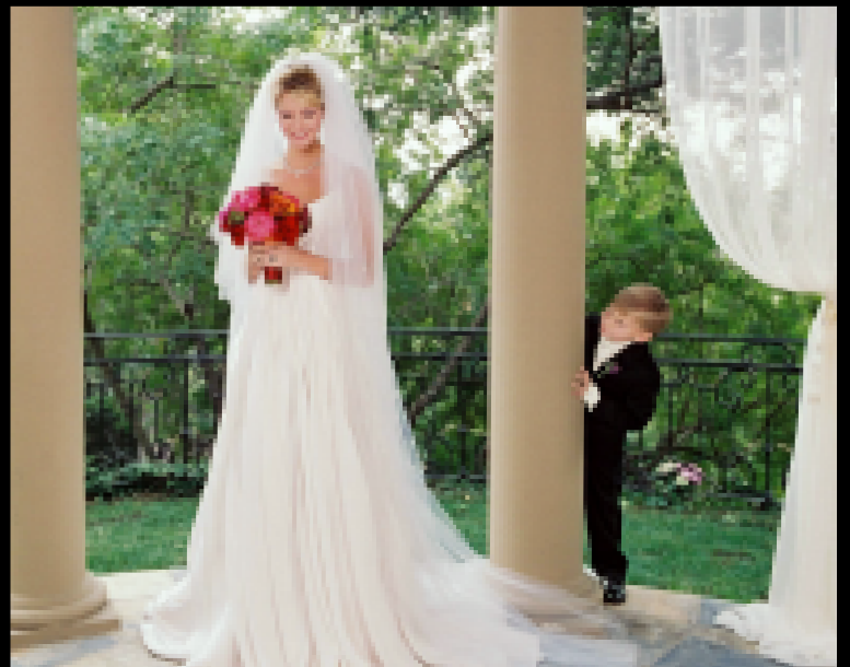
PORTRA 160NC Film