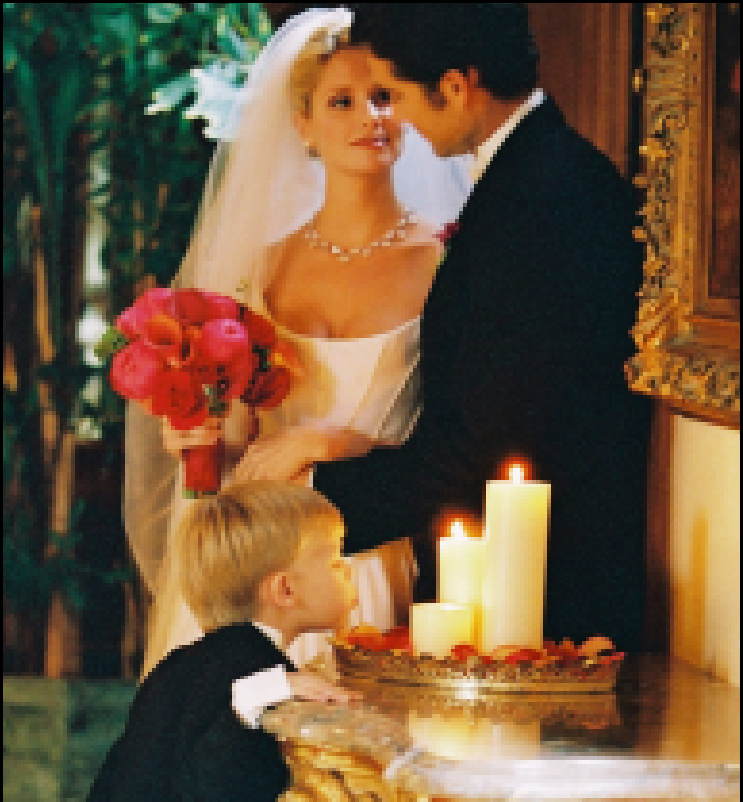
PORTRA 800 Film