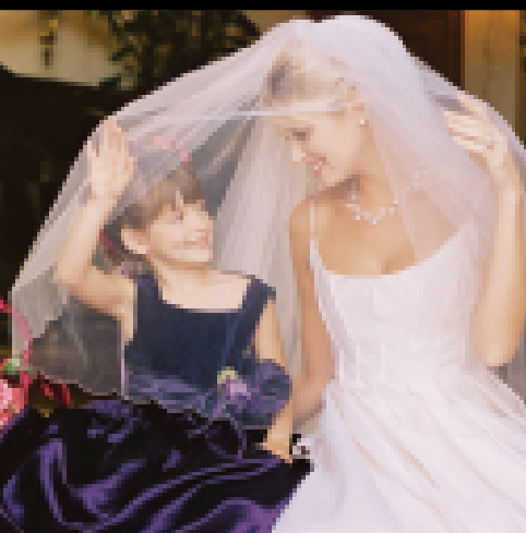
PORTRA 400VC Film