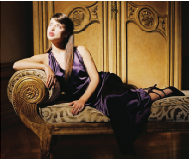
PORTRA 160NC Film