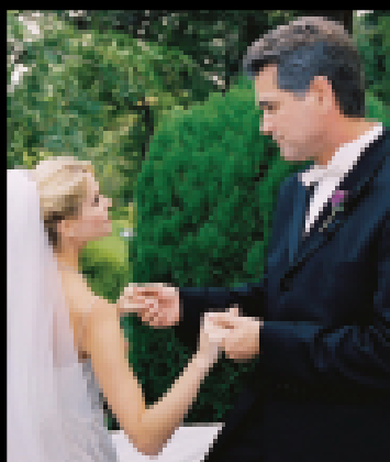
PORTRA 400NC Film