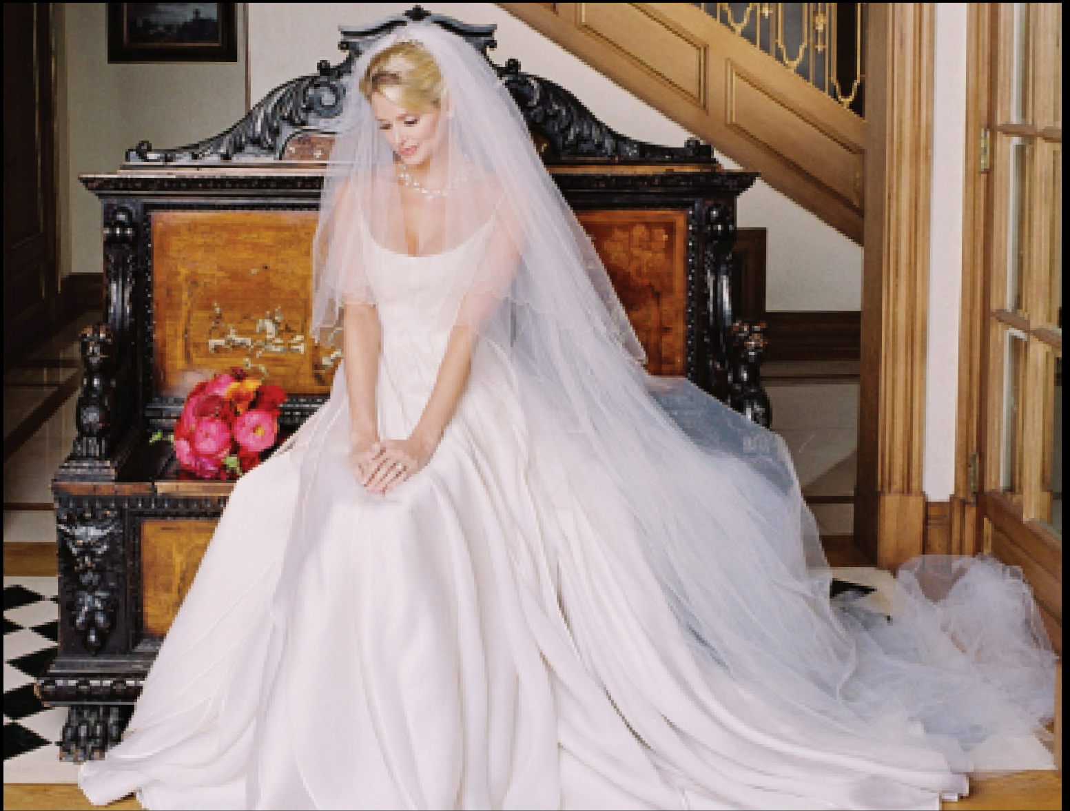
PORTRA 160NC Film