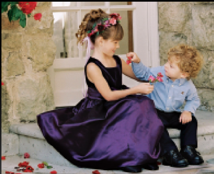
PORTRA 160VC Film