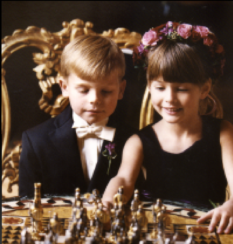
PORTRA 800 Film