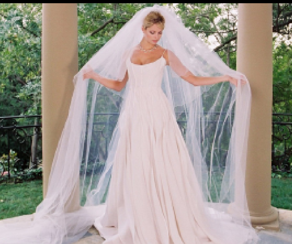
PORTRA 160NC Film

"Most photographers look for sharp. I look for emotion too. I get the feeling that they're in a private moment and no one else exists to them. That's what's priceless."