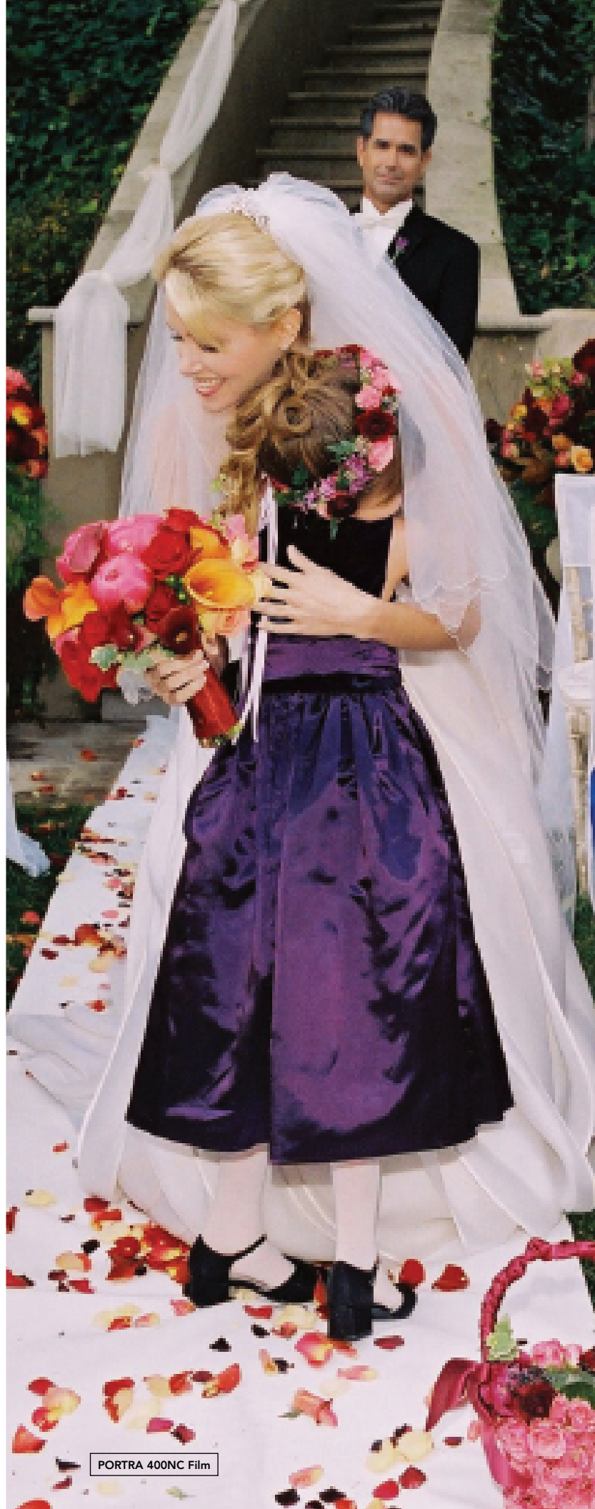
PORTRA 400NC Film

EVERY SHOOT IS FULL OF LITTLE SURPRISES. FORTUNATELY, THE FILM IS TOTALLY PREDICTABLE.