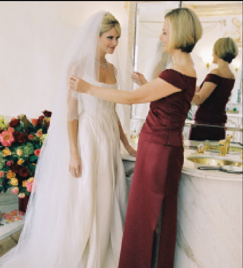
PORTRA 400NC Film