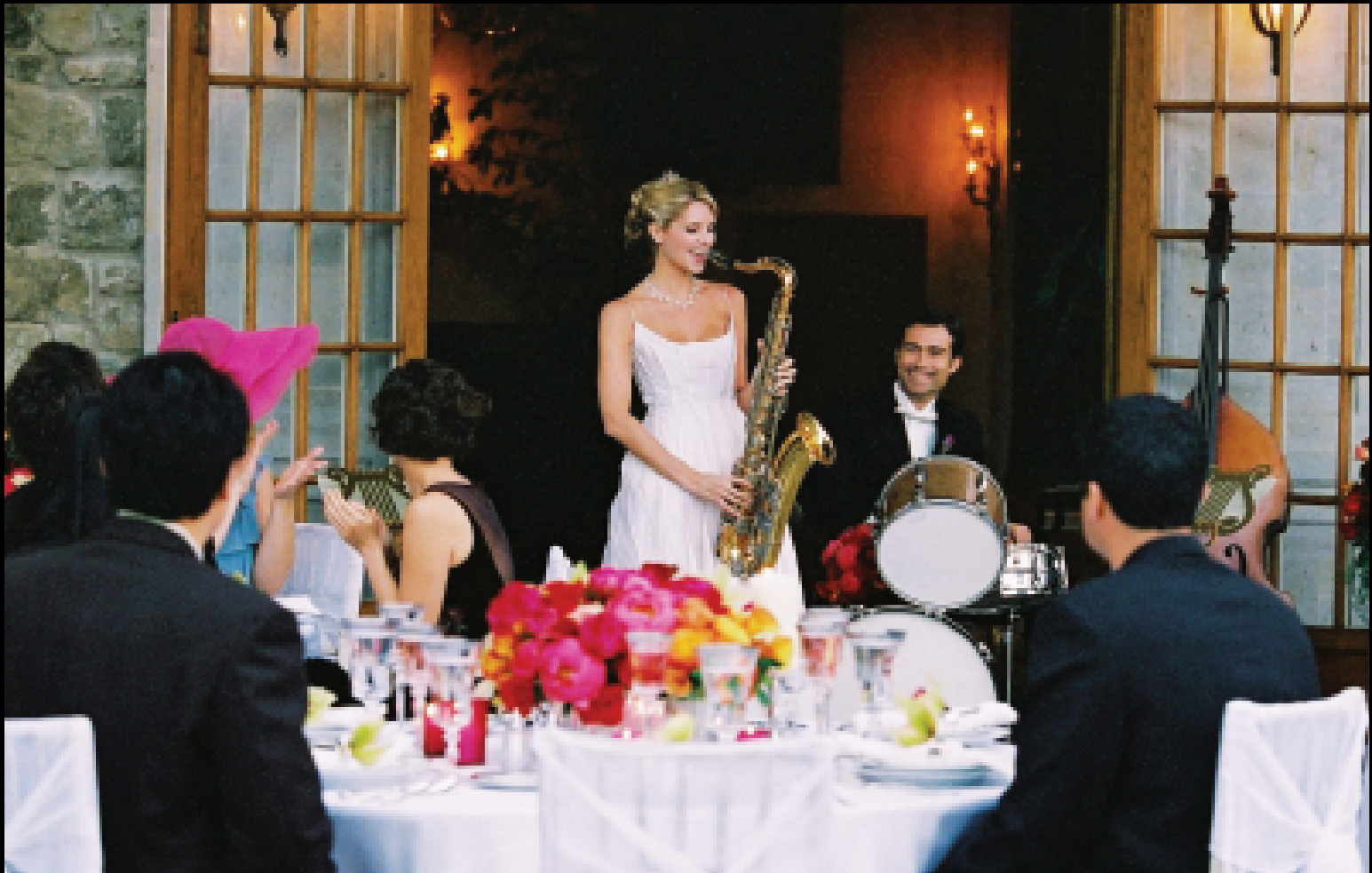
PORTRA 800 Film