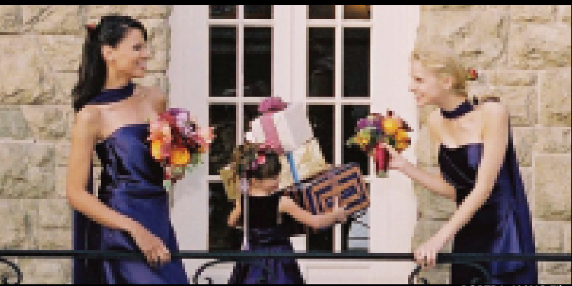
PORTRA 400NC Film