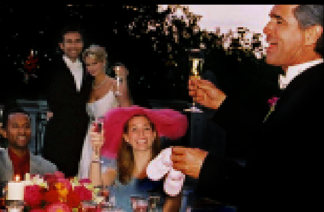
PORTRA 800 Film